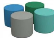
Furniture and Modular Products

For questions and assistance, reach out to Danielle.Christen@staples.com .