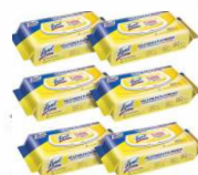
Cleaning and Disinfecting Supplies